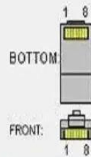
8 pin RJ45 (8P8C) male connector at the cables