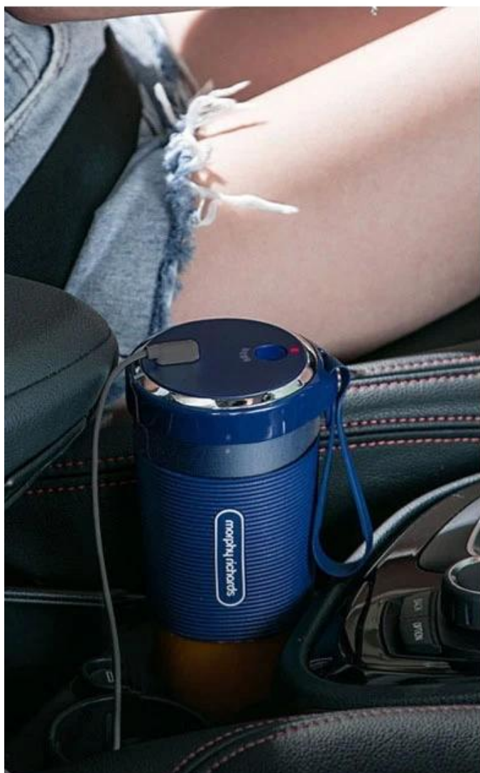
Magnetic smart watch charger Support charging in multiple scenarios